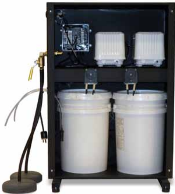
Shown with side panel removed